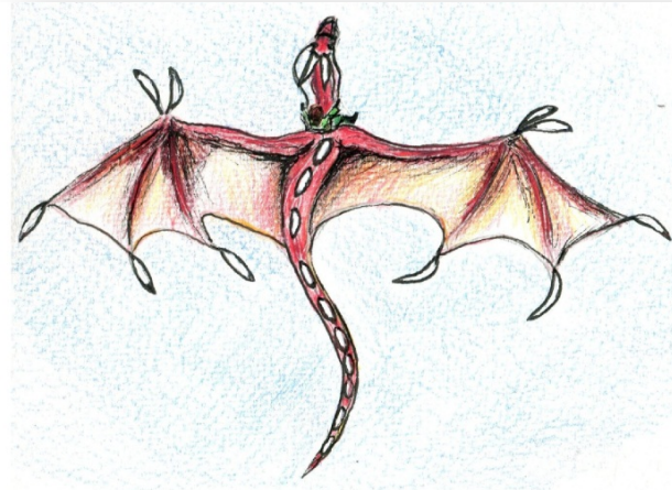
Dragon-Rider First Class

The Dragon-Rider First Class card is awarded to the player who is first to successfully complete the mission and ride the fierce Were-Beast .