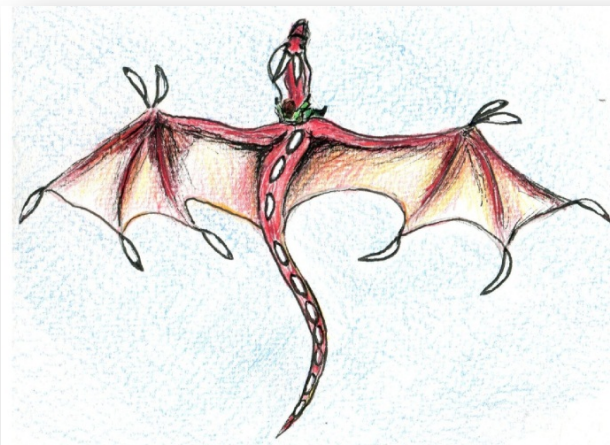
Dragon-Rider First Class