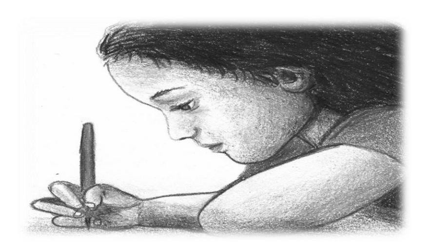
Basic Code CVC words through to CCVCC words